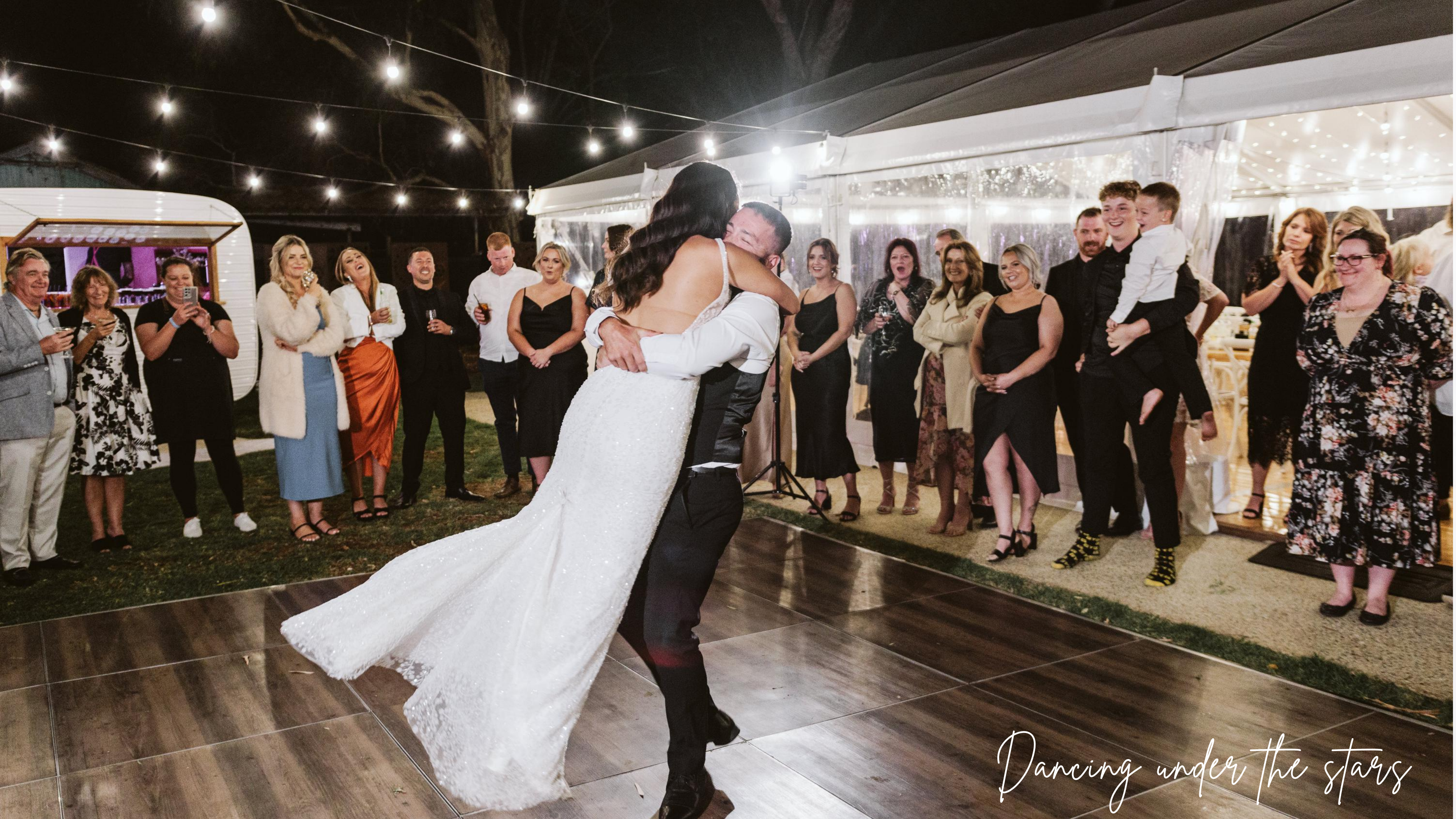
Dancing under the stars